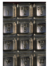
We have their number

To learn more, please contact us at 850.271.3566 or requests@thewebsleuth.com. We'll get back in touch with you promptly.